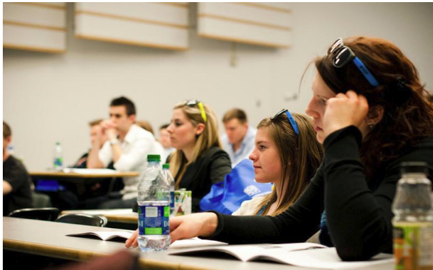
SUSK Delegates participate in Sessions