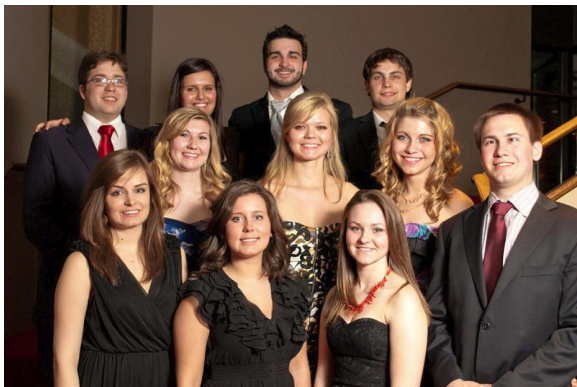
Members of the 2011/2012 SUSK Executive