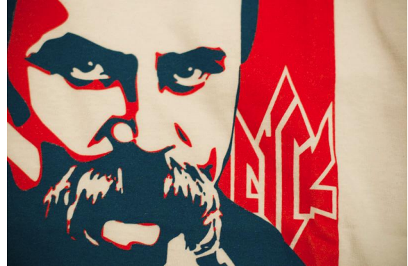
SUSK limited edition T-Shirts "Nadia" / "Hope"