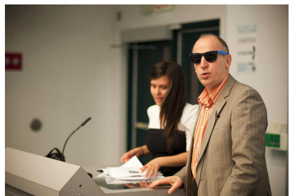
Ambassador of Ukraine Ihor Ostash addresses SUSK delegates wearing limited edition SUSK Sunglasses