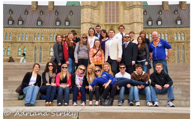
SUSK Delegates after touring Parliament Hill