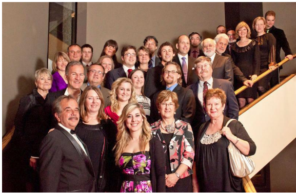
Various SUSK delegates and Alumni