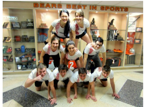
Team WUSA Waterloo Ukrainian Students' Association

The McMaster Ukrainian Students' Association kicked off its second semester by hosting the 10 th Annual Golden Horseshoe Volleyball Tournament & Zabava on February 4 th , 2012 in Hamilton, Ontario. This year the tournament had over 100 competitors in two categories of competition.