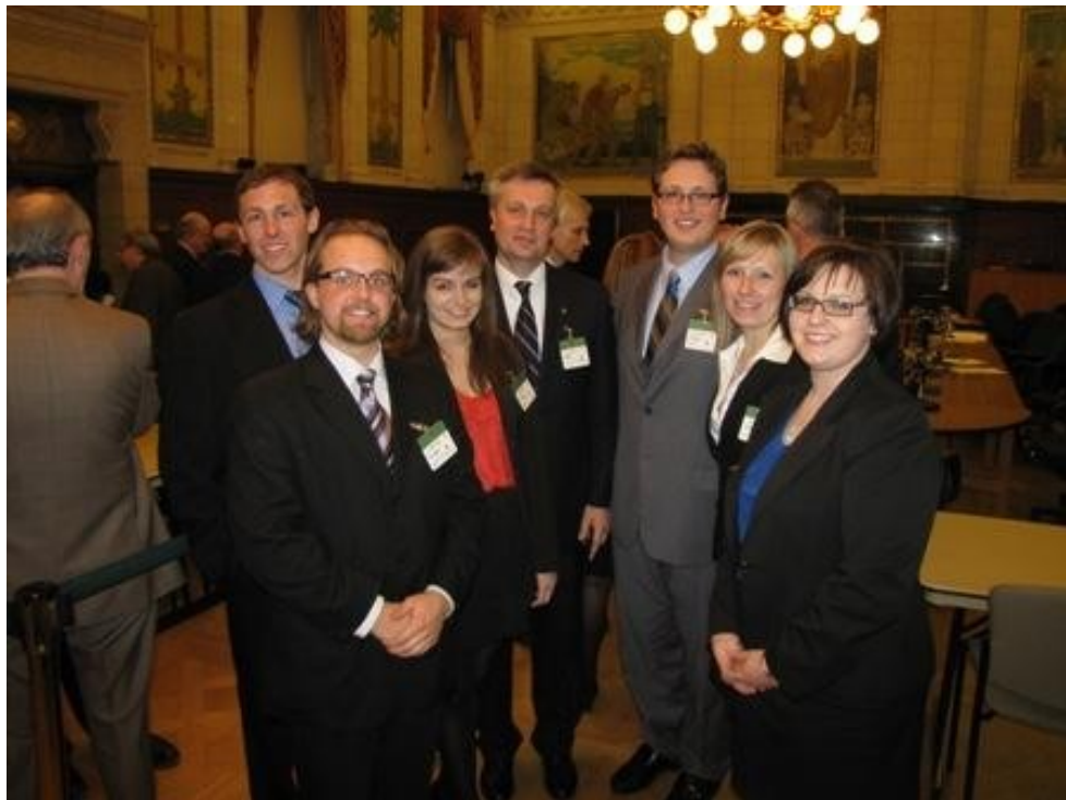
Some of the BCU Foundation Youth Leadership Delegation at the Hearings on Ukraine in Parliament

Canadian government's potential role in helping ensure fair and legitimate elections in Ukraine. As many of the speakers suggested, this is a long term enterprise, with a long term goal in mind. The most resoundingly logical way of accomplishing this, in my mind, is to engage the civil society in Ukraine, as many of the testifiers from Ukraine had underscored. The typical Ukrainian citizen is wary of challenging the established administration - a right some take for granted in Canada - for