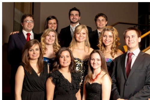
SUSK Executive 2011-2012

interested in running, you will be nominated for the position. The election process gives each candidate the opportunity to speak to his or her qualifications and then the Congress delegates will have the ability to question the nominees before the election takes place. If you think you are the right person for the job, check out the full job descriptions in the SUSK Constitution ( http://susk.ca/about/susk-constitution/ ) and join us in Hamilton for the National Congress.