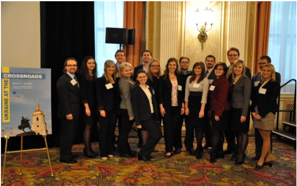
The youth delegation at the conference, sponsored by the BCU Foundation.

In my opinion, it would have been beneficial if more young adults- university students and young professionals- had attended the conference. Although it is imperative for the government of Canada to assist Ukraine in