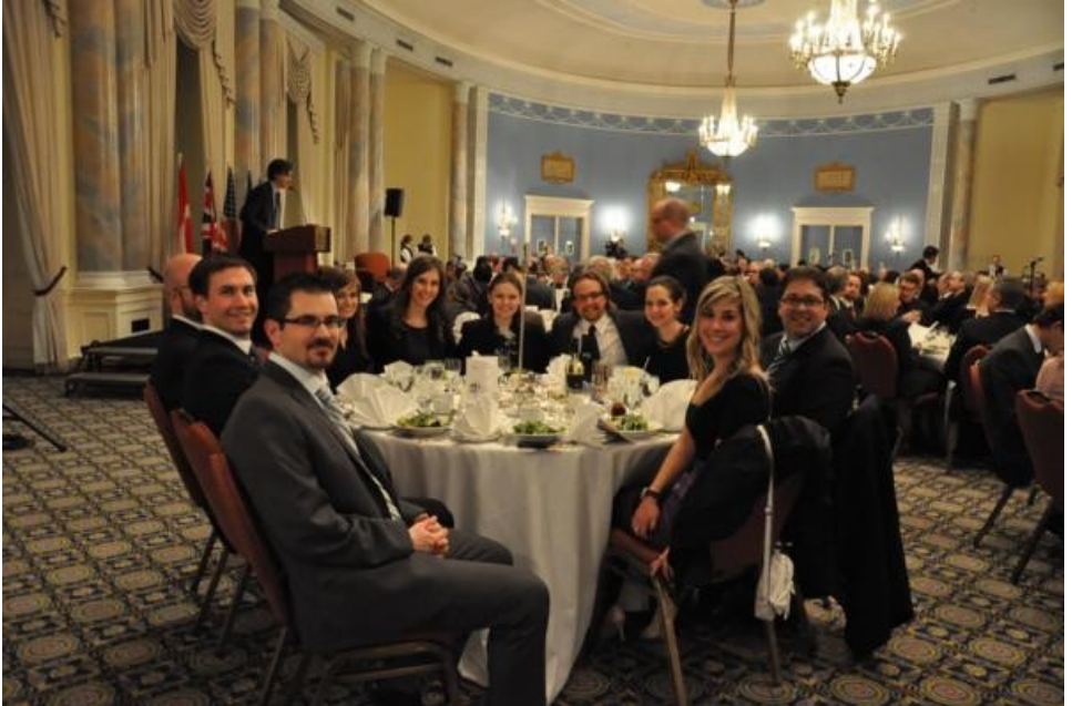
The youth delegation at the conference banquet. The event launched on March 7 with a banquet and a panel discussion moderated by Chrystia Freeland, Global Editor-at-Large at Reuters, and featuring current and former government officials.

In past visits to Ottawa and meetings with Members of Parliament, I have been witness to