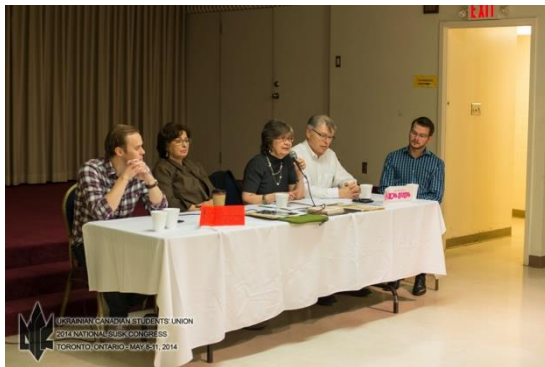
The SUSK Alumni Panel at the St. Vladimir Institute