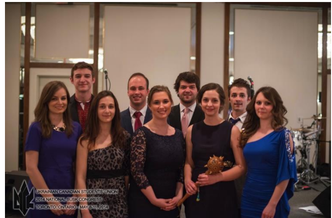
The 2014-2015 SUSK National Executive

Additional photographs may be viewed here: https://www.facebook.com/SUSKNational