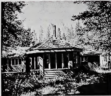
The Castle Mountain Hostel - one stop on this year's Congress itinerary